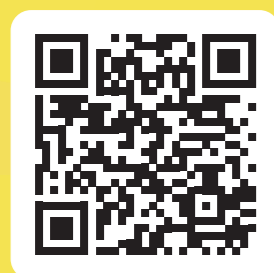
Add/Sub Getting Started Page